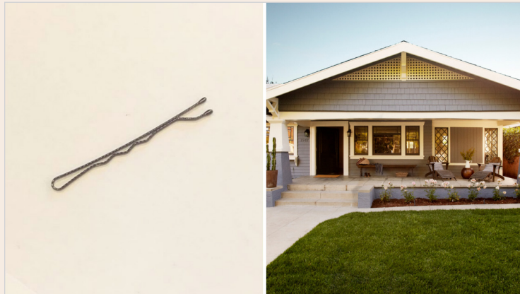
BOBBY PIN TO A HOUSE People love to invest in a journey