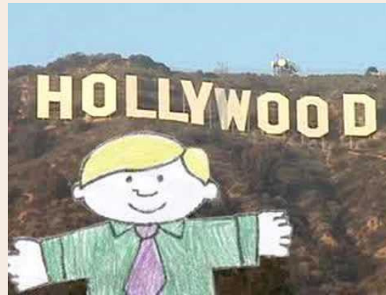
FLAT STANLEY a product making its way around the world