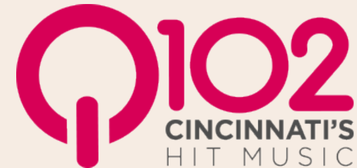
LOCAL RADIO Q102 has held scavenger hunts that engages listeners and encourages them to participate in their own journey

Cincinnati radio market has 1.8 million listeners